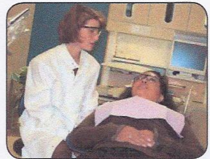
Discussing post-op instructions

To control discomfort , take pain medication before the anesthetic has worn off or as recommended.