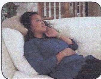
Lie down with your head elevated