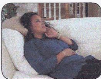
Lie down with your head elevated