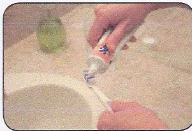
Use desensitizing toothpaste