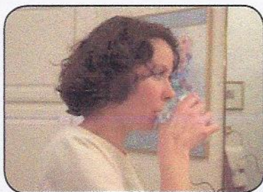
Rinse with warm salt water