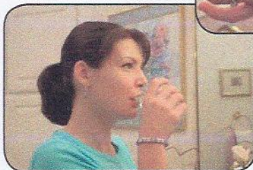
Rinse with warm water