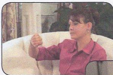
Wait two hours before eating

Don't use any tobacco products for at least 72 hours after the procedure because tobacco slows healing.